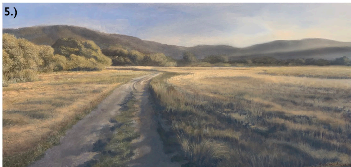
5.) "Summer Fields, Carmel Valley" Oil on canvas, 15" x 30" $7,500