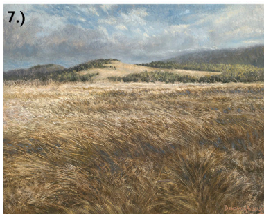
7.) "Orpheus I, Carmel Valley" Oil on linen, 16" x 20" $3,700