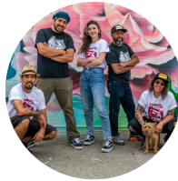
La Neta Mural Team @la.neta.murals

Listen in on the project background, best practices and community impact experiences.