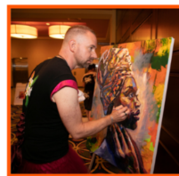
LIVE PAINTING BY PAUL RICHMOND @PAULYWORLD

CHARCUTERIE CONE & 2 GLASSES OF WINE FOR $20