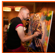
LIVE PAINTING BY PAUL RICHMOND @PAULYWORLD

CHARCUTERIE CONE & 2 GLASSES OF WINE FOR $20