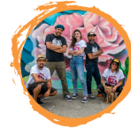
La Neta Mural Team