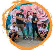
La Neta Mural Team