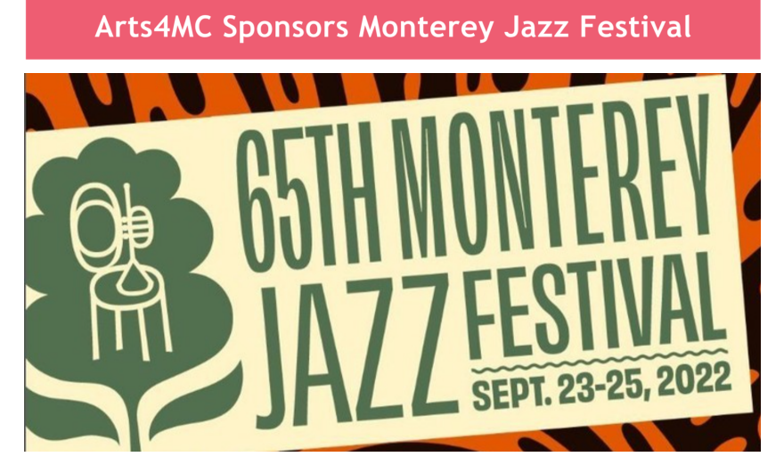
The Arts Council for Monterey County is proud to be a sponsor of the 65th Monterey Jazz Festival!

Visit Arts4MC at booth 205 to participate in our Community Art Project on Friday, Saturday and Sunday, Sept. 23 - 25th at the Monterey Fairgrounds. We hope to see you there!