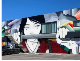
Private Tour of Sand City Murals for 8 People