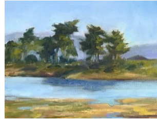
"Wetlands Near Moss Landing" by Kati D'Amore