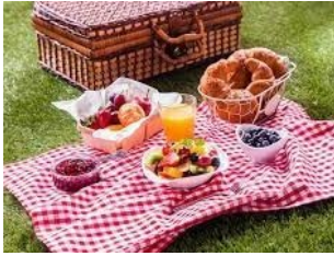
Picnic Day at Forest Theater