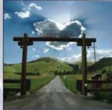
Nonprofit RANCHO CIELO YOUTH CAMPUS