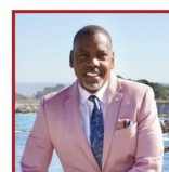
LUMINARY John Nash