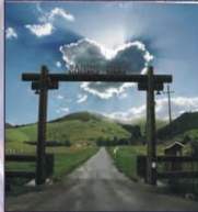
Nonprofit RANCHO CIELO YOUTH CAMPUS