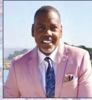
Luminary JOHN NASH