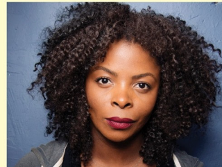
JANELLE JAMES FRIDAY, MARCH 13, 2020 AT 8PM