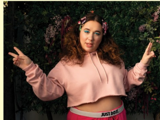
LIZA TREYGER FRIDAY, DECEMBER 20, 2019 AT 8PM