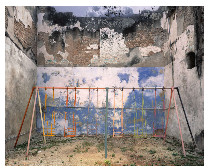
Congratulations to our County Arts & Culture grantee Carl Cherry Center for the Arts! We are excited to join you! Exhibit Opens 8/23 from 5-7 pm 4th and Guadalupe, 4th Ave, Carmel-By-The-Sea, CA For more info about our grants visit arts4mc.org/grants/