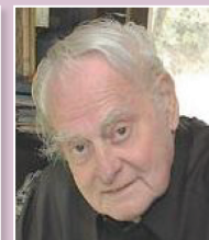
Eldon Dedini ♥