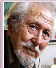
Gus Arriola ♥