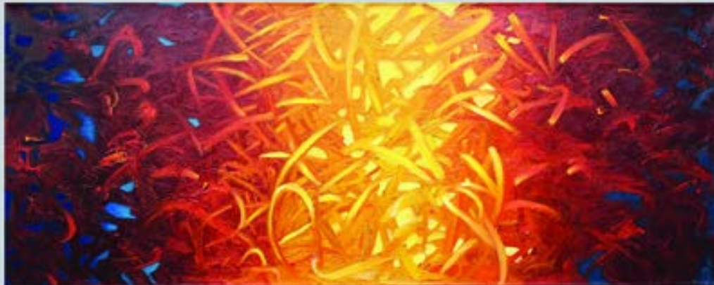
Deborah Good "Birth/Death" 60" x 24" acrylic on canvas $1,000

ArtWorks @Pacific Grove Studios & Gallery · A local artist's cooperative