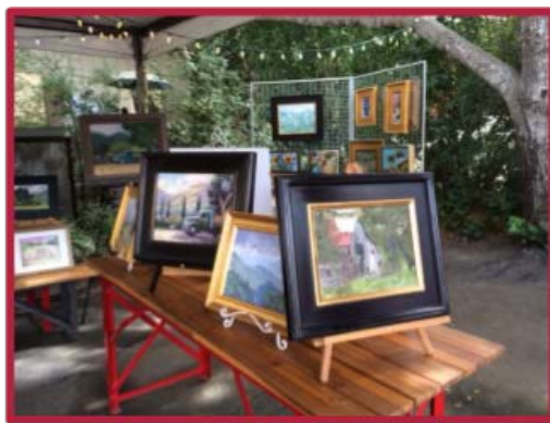
Patio Art Sale. 4th Annual "Paint The Village" 2017.