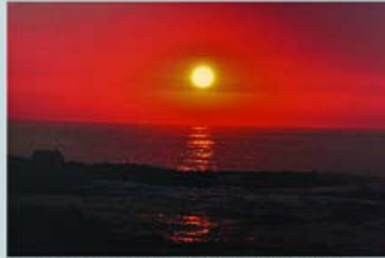
James Beaulieu "Fire in the Sky" 24"x 66" photograph $225

Join us for an evening of conversation original art, and enjoy music by