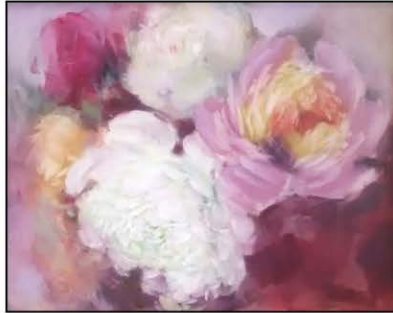
"Relationships," by Stacey Ashton. Oil