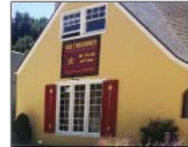
SOL TREASURES Nonprofit

To become a sponsor click the Sponsorship packet