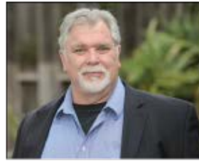
REG HUSTON Philanthropist